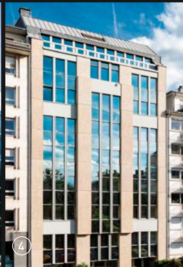
Photo 1: BCL Headquarters Photo 2: Pierre Werner building Photo 3: Monterey building Photo 4: 7, boulevard Royal building