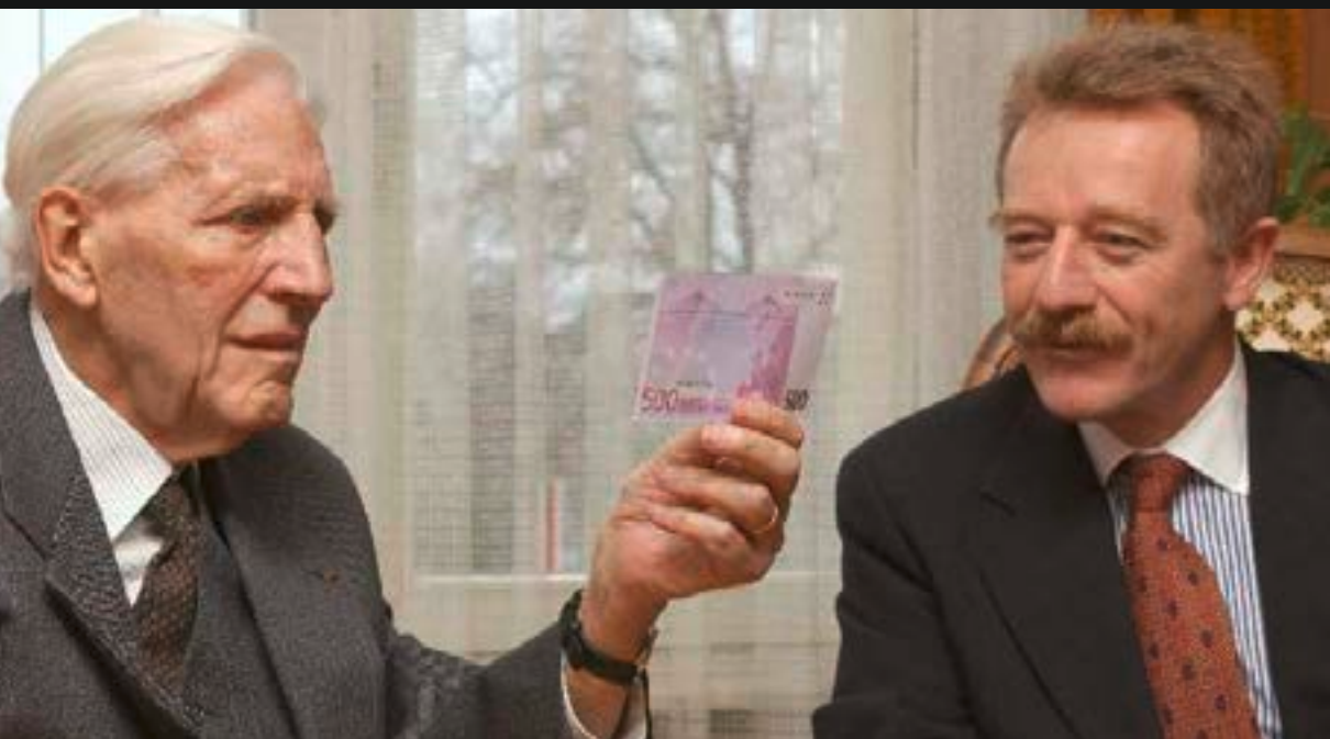
Photo: 4 December 2001. The first Governor of the BCL, Mr. Yves Mersch, hands a first euro banknote to Mr. Pierre Werner.

At the European summit of 2 May 1998, eleven EU Member States were designated to enter the euro area: Austria, Belgium, Finland, France, Germany, Ireland, Italy, Luxembourg, the Netherlands, Portugal and Spain. These Member States introduced the single currency (starting as scriptural money only) on 1 January 1999, when the euro area was endowed with a single monetary policy. Euro banknotes and coins were introduced on 1 January 2002. Since 1999, other EU Member States have joined the euro area: Greece (2001), Slovenia (2007), Cyprus (2008), Malta (2008), Slovakia (2009), Estonia (2011), Latvia (2014) and Lithuania (2015).