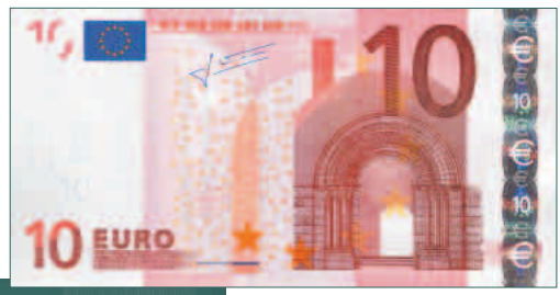
In 2008 all ECB publications feature a motif taken from the €10 banknote.