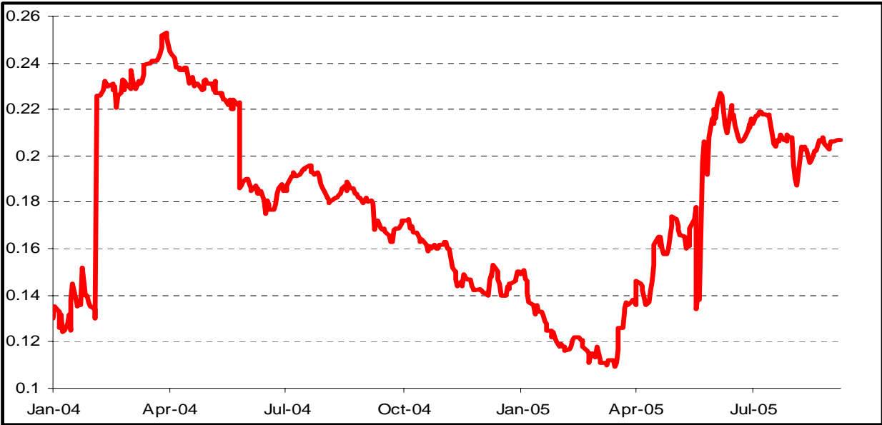
Table XI. Interest rate spreads on the 10 year benchmark : Italy-Germany (daily date since January 2004)